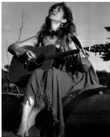
Wild wandering fiddle